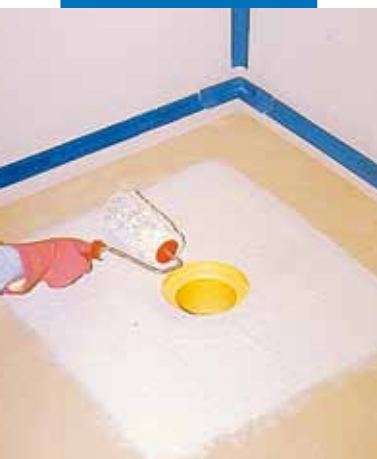
Spreading Mapegum WPS around the drain in a shower cubicle