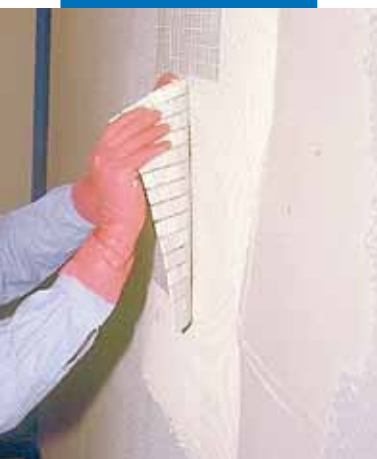
Laying glass mosaic