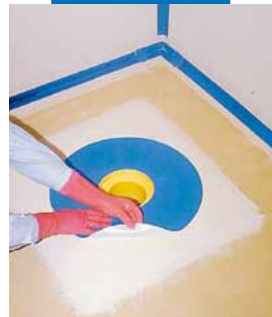
Positioning the special piece of Mapeband over Mapegum WPS

Mapegum WPS is available in 5, 10 and 25 kg drums.