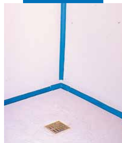
End result of a waterproofing treatment using Mapegum WPS and Mapeband