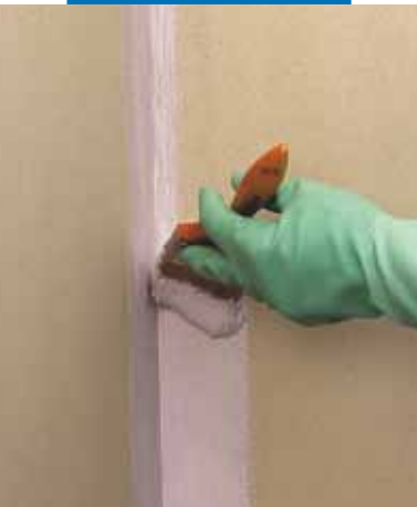
Applying Mapegum WPS with a brush