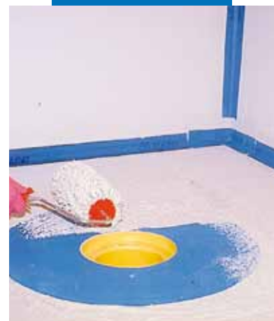
The special piece of Mapeband embedded in the Mapegum WPS