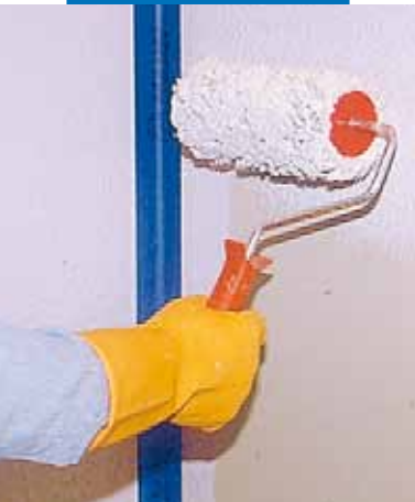
Applying Mapegum WPS on a wall with a roller