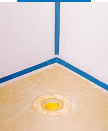
Bathroom wall waterproofed with Mapegum WPS and Mapeband