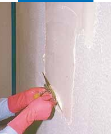
Spreading a coat of adhesive on Mapegum WPS